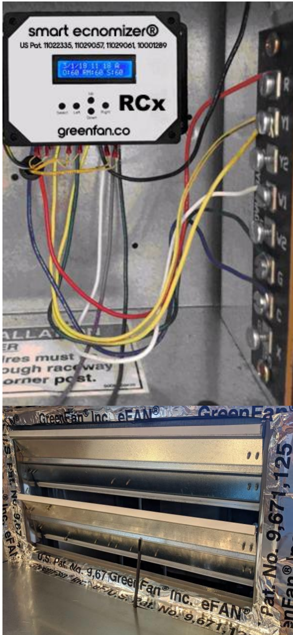
U.S. Patents 9671125, 10,001,289 11022335, 11029061, 11029057, 11175060